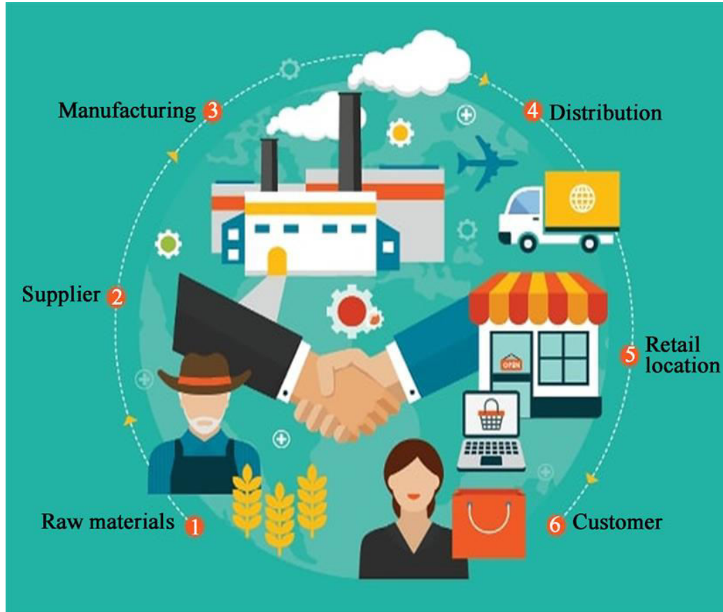
Figure 1. Supply chain management.